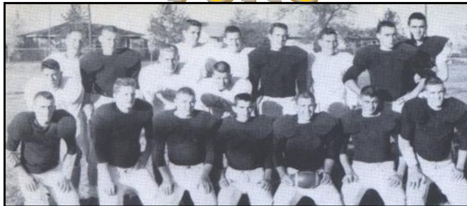
CLASS OF 1961 FOOTBALL PLAYERS